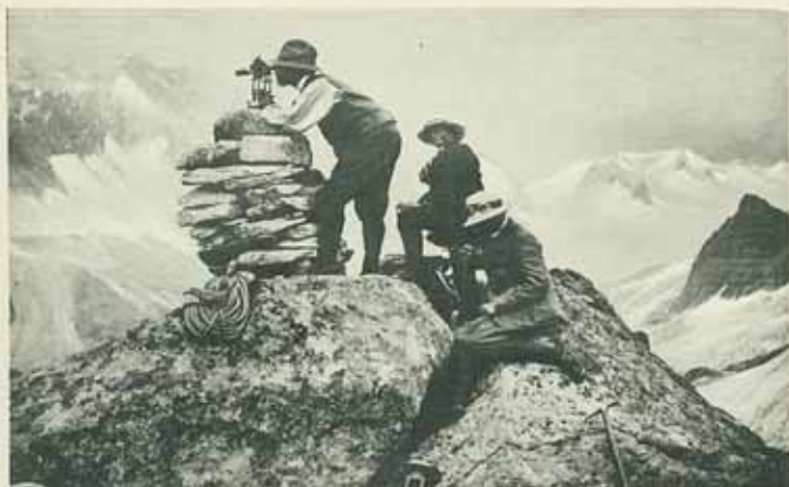
Visée topographique à Tré-la-Porte, par J. Vallot.